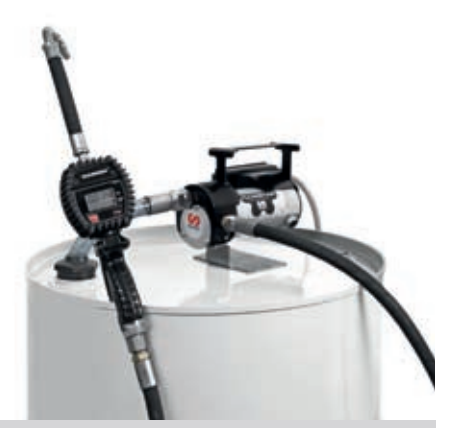
12 & 24 V DC GEAR PUMP FOR OIL KITS WITH METER

12 V or 24 V gear pumps for oil equipped with 3 m suction hose with foot valve, 3 m x 1/2" delivery hose and hose end meter 365 603. Approximate delivery: 4 l/min.