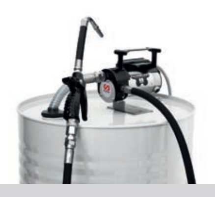
12 & 24 DC GEAR PUMPS FOR OIL KITS

561 025 Gear pump for oil kit with meter, 24 V DC