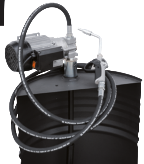
VISCOMAT GEAR DRUM AC