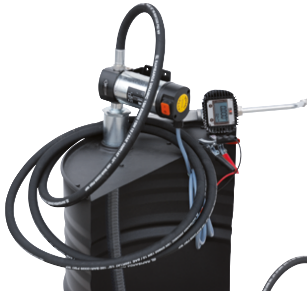
VISCOMAT GEAR DRUM DC