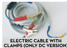
ELECTRIC CABLE WITH CLAMPS (ONLY DC VERSION)