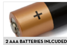
2 AAA BATTERIES INCLUDED