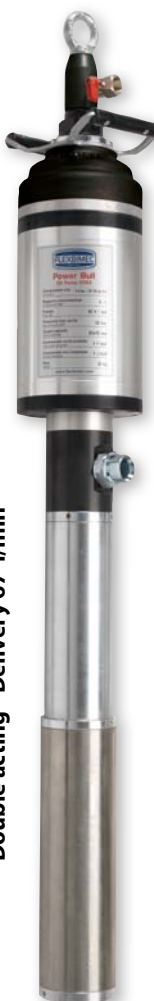
Double acting - Delivery 67 l/min