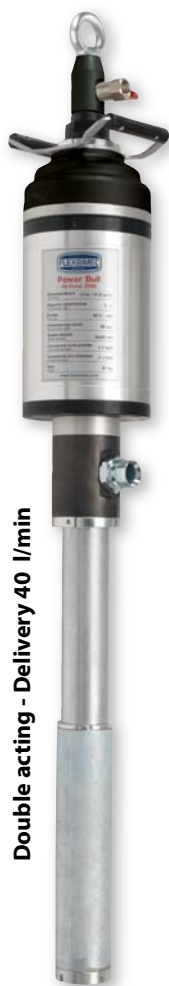
Double acting - Delivery 40 l/min