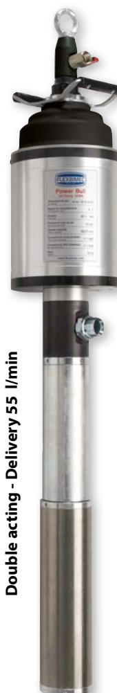
Double acting - Delivery 55 l/min