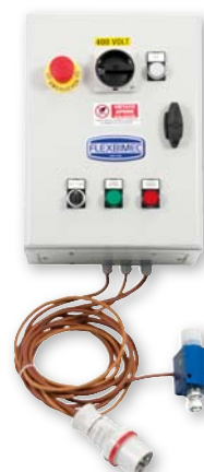
Adjustable pressure switch Art.no. 4265