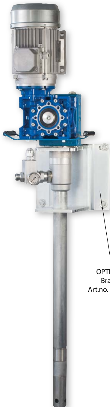
OPTIONAL Bracket Art.no. 2214/50