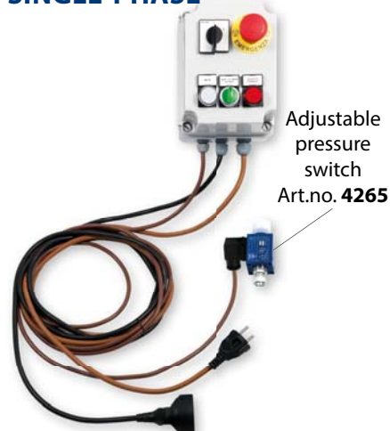
Adjustable pressure switch Art.no. 4265