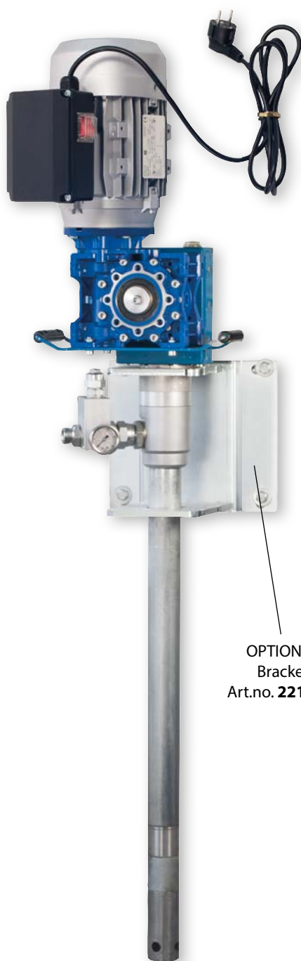
OPTIONAL Bracket Art.no. 2214/50