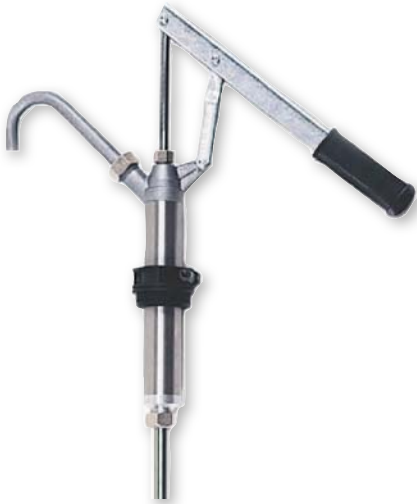
Art.no 5480 RINOX 80

Lever action, single acting drum pump in stainless steel, delivery 8 l/min, for the use in 200 l - drums, with curved rigid outlet, bung adapter for the fixation on drum and gaskets in Viton®.